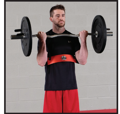
Shown with optional Olympic Weights, Collars and Bicep Bomber(BB25):